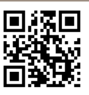
Tienda online Manises On