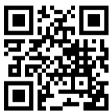
AVEC Gremio shop